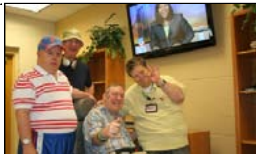
Clients enjoying new DEP Classroom at UPARC/Long Center.

Driver's License Renewals have raised over $6.5 million, benefitting organizations such as Prevent Blindness, Juvenile Diabetes Foundation, Family First and many others. Motor Vehicle Registration have raised over $27 million for 14 various charities since 1984. Of the funds designated to the developmentally disabled through the DMV, 75% will be distributed to the local ARC Chapters for programs and services, 15% will be put aside for Training Services and 10% will be earmarked for Arc of Florida administrative fees.