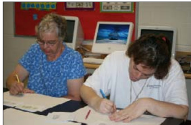
Clients creating cards

Teddy Bears were made by the students in the sewing class and were donated to the children at The Haven spouse abuse shelter.