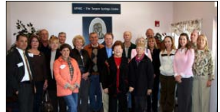
Agency and Foundation Board and staff visiting UPARC's Tarpon Springs Center

There was a lot to see and learn about in those few short hours but for those in attendance, it was a great experience.