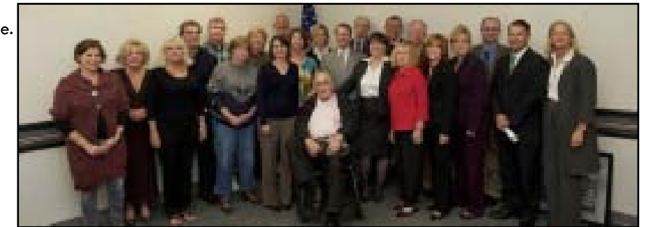
UPARC Foundation Board Members