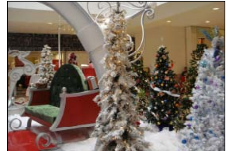
Festival of Trees 2009