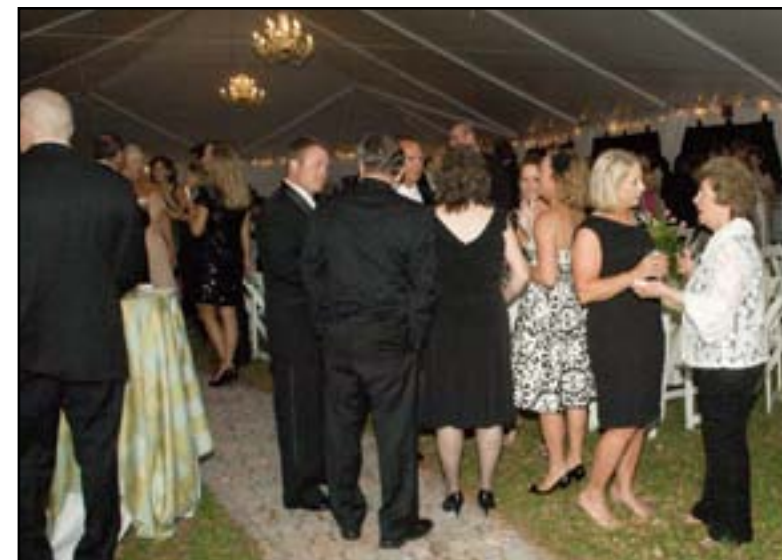
Omelette Party 2010.