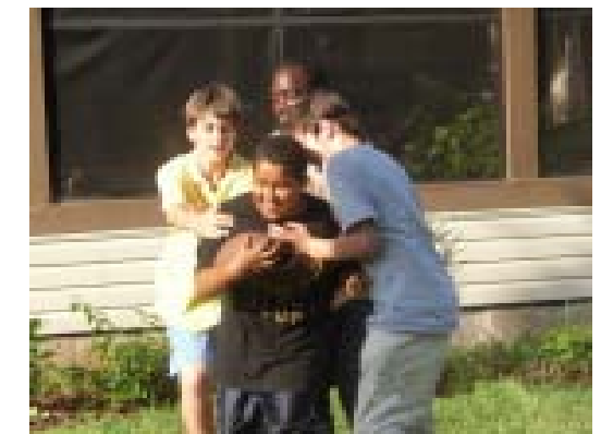
The Winding Creek family at play