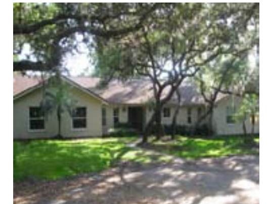
Our "Newest" Home

The six boys, ages 9-16, that moved into Winding Creek are already showing improvement in their behavior and lives. The smiles on their faces prove the increased sense of self-worth, confidence, and responsibility for their home. You can almost hear the laughter in the backyard when you look at the pictures.